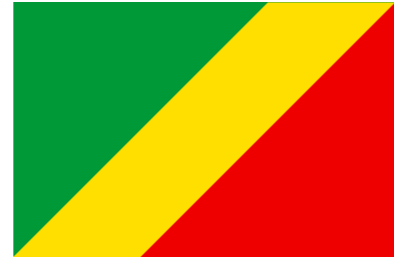
Republic of the Congo