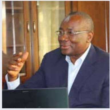
Karim Meckassoua Former Minister of Foreign Affairs of the Central African Republic, Friend of the Brazzaville Foundation

“ There was a significant risk that, in the absence of a negotiated solution, the Polish priest and his 25 companions, 10 Central African citizens and 15 Cameroonians, would be handed over to Nigerian jihadists and the terrorist group Boko Haram. The concerted approach of Brazzaville Foundation, the President of the Republic of Congo, the Polish, French and European authorities, shows that the path to reconciliation and peace is possible in the Central African Republic. ”